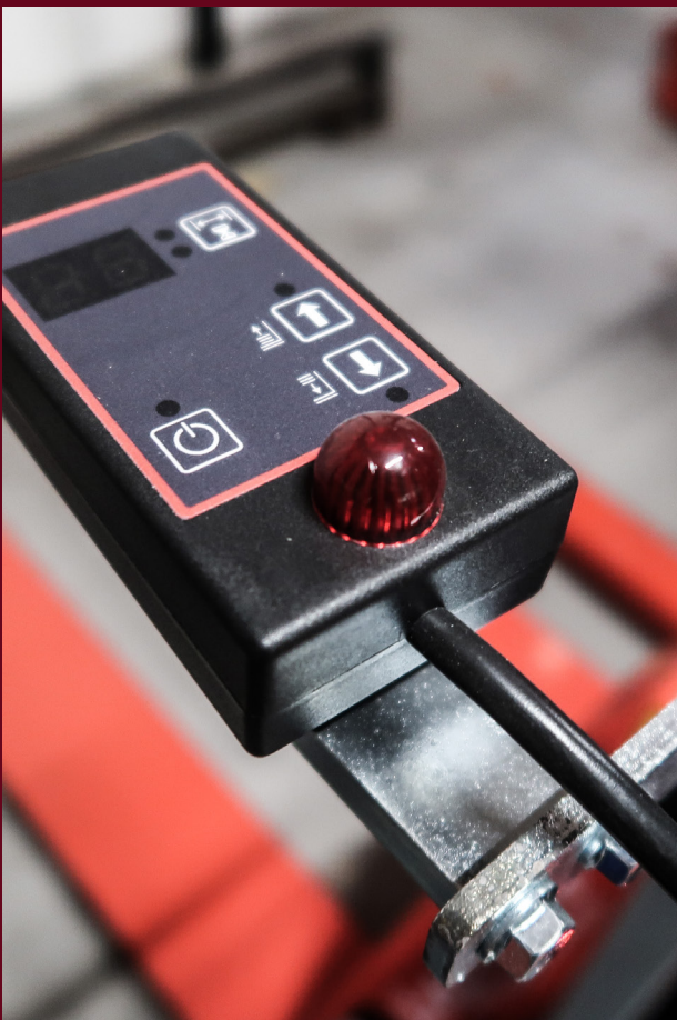
Automatic level control for constant ergonomic working height.

By signal from an electric sensor, the forks raise/lower automatically - and the settings can be adjusted to individual operators.