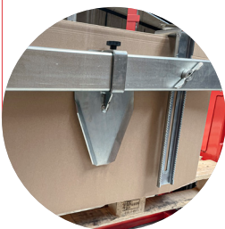
Optional extra: side support plates