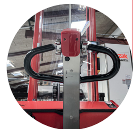
Ergonomically correct handle