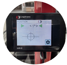
Intuitive screen to preset rotation angles and speed