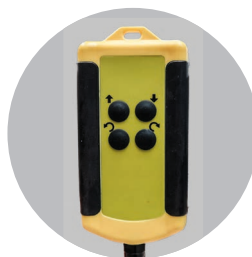
Remote control for lifting, lowering, and rotation