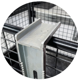
Clamps and box holders adapted to individual needs