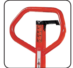
Ergonomic handle ensures the user a relaxed hold. The handle can be marked with the name/department.

Available with manual and electric lifting.