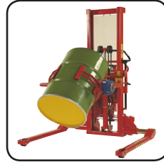
Available with side-tilting forks and/or optional extras, e.g. drum turner, remote control, level control, crane arm.