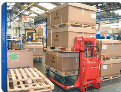
Strong construction ensures a long operating life and low maintenance costs.

We also offer tailor-made solutions. Please ask for further information or visit www.interthor.com