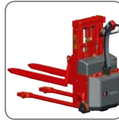
Hour counter, battery indicator and error finding in the same instrument. Motor brake.