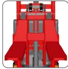
Adjustable carriage is standard.