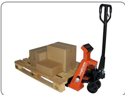
The BFC6 transports and weighs goods in the same work procedure.