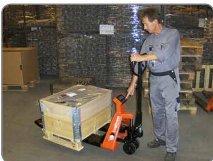
The ideal weighing system – solid, accurate and easy to use all over the company!