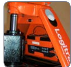
Built-in charger with an easily accessible charger plug.

Please ask for further information or visit our website www.interthor.com