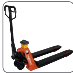
Accurate weighing results with four built-in weighing cells.