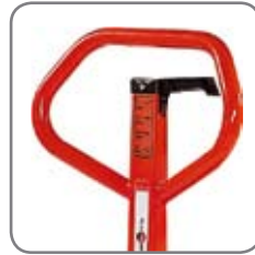
Ergonomic handle ensures the user a relaxed hold. The handle can be marked with the name/department.

Strong construction ensures a long operating life and low maintenance costs.