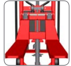
Adjustable forks are standard for LF Mini and are available for ELF as optional extra.

Available with manual and electric lifting.