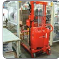
High maneuverability: Short overall length, large turning angle, assisted steering and low own weight.