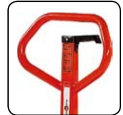
Ergonomic handle ensures the user a relaxed hold. The handle can be marked with the name/department.

Available with manual and electric lifting.