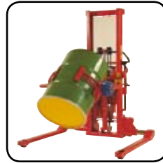
Available with side-tilting forks and/or optional extras, e.g. drum turner, remote control, level control, crane arm.