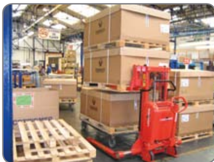
Strong construction ensures a long operating life and low maintenance costs.