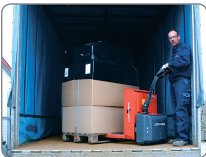
Panther Maxi (capacity 4000 lbs.) is perfect for heavy pallet transport, e.g. in the transport industry.