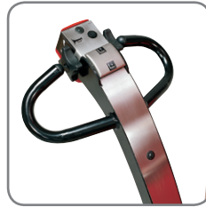
Possible to operate with handle upright. Central location of all control buttons.