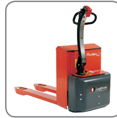
Strong construction ensures a long operating life and low maintenance costs.