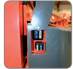
Easy access to all components makes service of the truck straightforward.