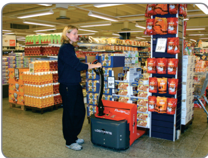
Panther Mini (capacity 3100 lbs.) is perfect for easy pallet transport, e.g. in super markets and in stock areas.