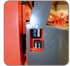
Easy access to all components makes service of the truck straightforward.