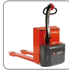
Strong construction ensures a long operating life and low maintenance costs.