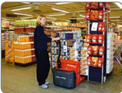
Panther Mini (capacity 3100 lbs.) is perfect for easy pallet transport, e.g. in super markets and in stock areas.