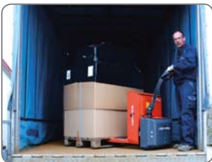
Panther Maxi (capacity 4000 lbs.) is perfect for heavy pallet transport, e.g. in the transport industry.