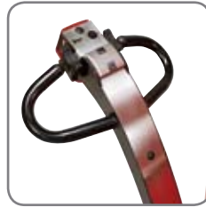
Possible to operate with handle upright. Central location of all control buttons.