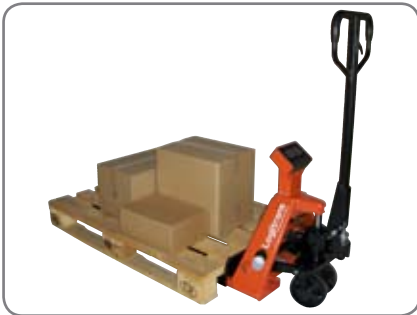
The BFC6 transports and weighs goods in the same work procedure.