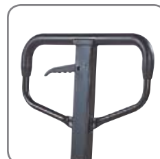
Rubber covered handle ensures a comfortable hold.