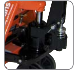
Reliable leak-proof hydraulic system.