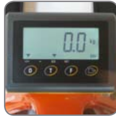
The BFC6 has tare and zero setting, and can show kg or lb.