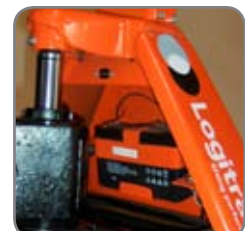
Built-in charger with an easily accessible charger plug.

Please ask for further information or visit our website www.interthor.com