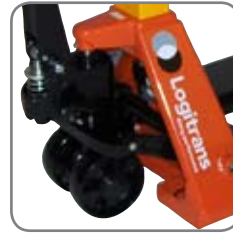
The turning angle of BFC6 is 210°, ensuring easy operations in confined areas.