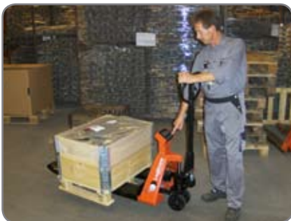
The ideal weighing system – solid, accurate and easy to use all over the company!