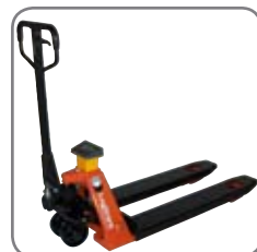
Accurate weighing results with four built-in weighing cells.