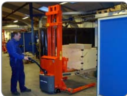
For intensive use, we recommend SELF or SELFS.