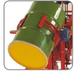
Available with optional extras, e.g. crane arm, drum turner, boom, remote control and level control.