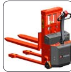
Hour counter, battery indicator and error finding in the same instrument.