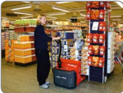
Panther Mini (capacity 3100 lbs.) is perfect for easy pallet transport, e.g. in super markets and in stock areas.