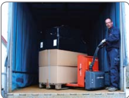
Panther Maxi (capacity 4000 lbs.) is perfect for heavy pallet transport, e.g. in the transport industry.