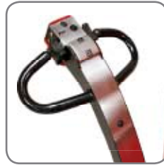
Possible to operate with handle upright. Central location of all control buttons.