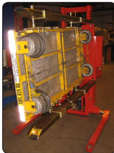
Logiflex straddle stacker with Rotator for the handling of small railway trolleys when carrying through service and repair. P06348-2