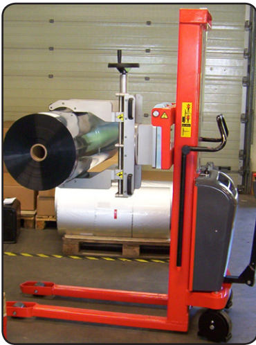
Special reel clamp for very smooth and 440 lbs heavy reels of anti-magnetic folio for electronic parts. P08025

Only the laws of nature and safety reasons define the limits!