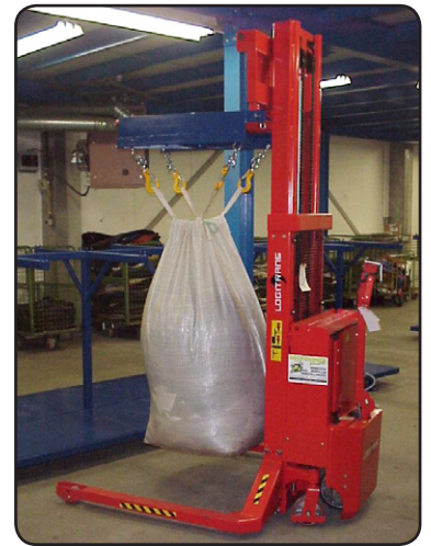
Full Power Straddle Stacker is part of a line that handles second hand clothes. The clothes are checked for damages, and put into big white bags. 03174FC4