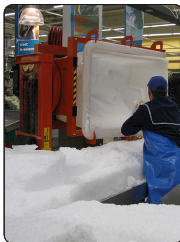
A Full Power Unit with Rotator is used in a supermarket early in the morning to transport ice to the fish department. P05707-2