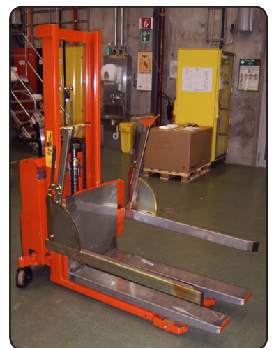
Stacker with Rotator with stainless plating. When transporting stainless containers, they are not damaged and no particles of paint will get in touch with the containers.