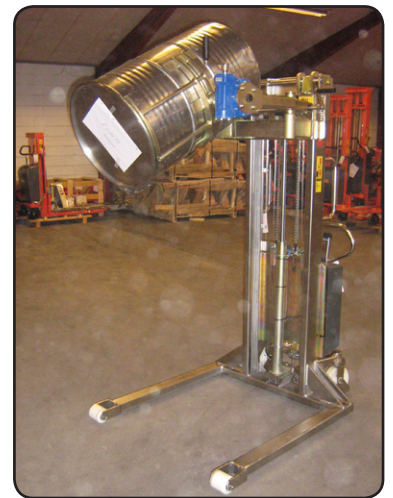
Stainless stacker with drum turner for lifting and emptying drums. P06634