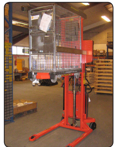
Logiflex ELF with Rotator used at the Swedish postal services for emptying letter containers into sorting machines. P06473