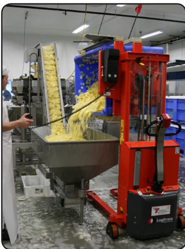
A Norwegian manufacturer of prepared foods for catering centres and groceries uses the fully powered Logiflex with Rotator, when handling vegetables, cream, etc.