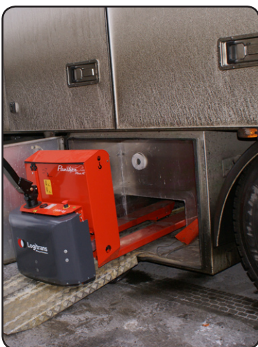
A special low construction makes it possible to place a Panther Maxi AC in a transport box under the lorry during transport. This gives room for two more pallets in the lorry. P04354