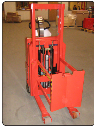
Trans-Stacker (Logiflex Maxi) with special drum lifter. One of the handle grips of the drum is used to secure the drum. P07267-2