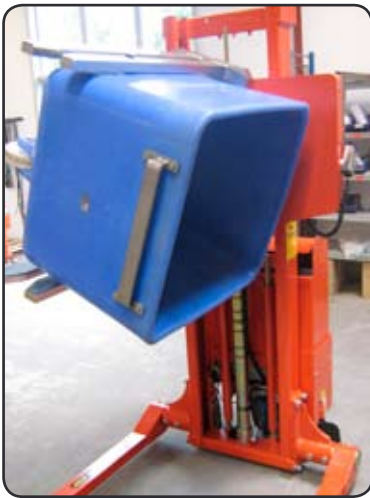
Full Power Stacker with Rotator for the handling of Vemag-containers. Used at a marzipan factory in Denmark. P06692

the products. Our Custom-built products are developed based on our very flexible standard range of products without compromising safety.