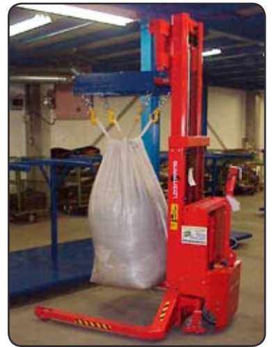
Full Power Straddle Stacker is part of a line that handles second hand clothes. The clothes are checked for damages, and put into big white bags. 03174FC4