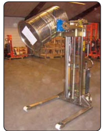
Stainless stacker with drum turner for lifting and emptying drums. P06634