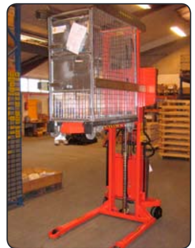
Logiflex ELF with Rotator used at the Swedish postal services for emptying letter containers into sorting machines. P06473