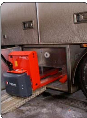
A special low construction makes it possible to place a Panther Maxi AC in a transport box under the lorry during transport. This gives room for two more pallets in the lorry. P04354