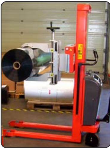
Special reel clamp for very smooth and 440 lbs heavy reels of anti-magnetic folio for electronic parts. P08025

Only the laws of nature and safety reasons define the limits!