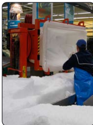
A Full Power Unit with Rotator is used in a supermarket early in the morning to transport ice to the fish department. P05707-2