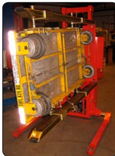
Logiflex straddle stacker with Rotator for the handling of small railway trolleys when carrying through service and repair. P06348-2