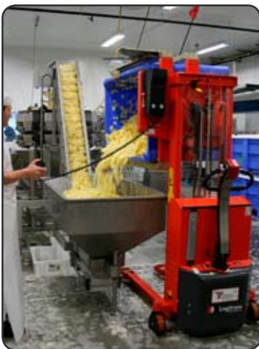
A Norwegian manufacturer of prepared foods for catering centres and groceries uses the fully powered Logiflex with Rotator, when handling vegetables, cream, etc.