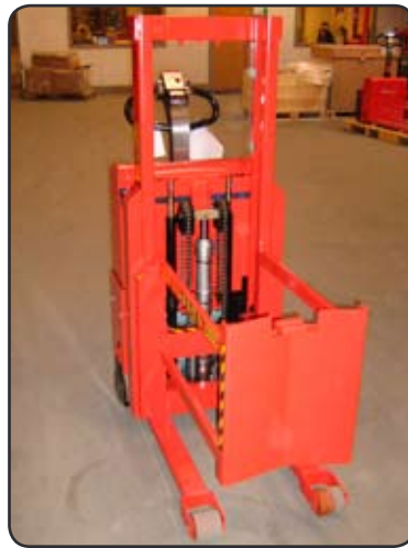
Trans-Stacker (Logiflex Maxi) with special drum lifter. One of the handle grips of the drum is used to secure the drum. P07267-2