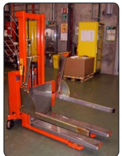
Stacker with Rotator with stainless plating. When transporting stainless containers, they are not damaged and no particles of paint will get in touch with the containers.