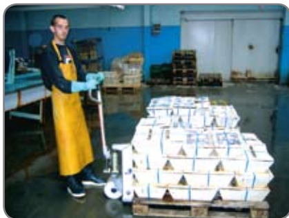
RF-SEMI - for the food industry in areas, where hygiene demands are not so high, but corrosion resistance important.