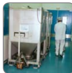
RF-PLUS pallet truck being used in the pharmaceutical industry.