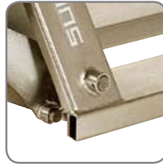
Completely open or completely closed truck elements facilitate efficient cleaning.