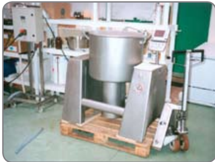
RF-PLUS - for the food industry and the pharmaceutical industry with strict hygiene and sanitation requirements.