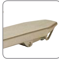
Closed forks mean easy cleaning and few hiding places for bacteria.