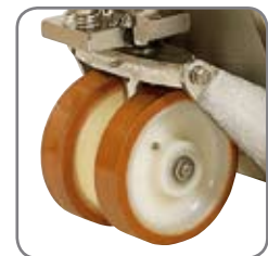
Wheels with rubber-sealed bearings.

Please ask for specification details or visit our website www.interthor.com We also offer tailor-made solutions.