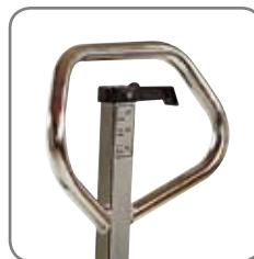
Ergonomic handle ensures the user a relaxed hold.