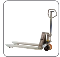
The pallet truck is also available with different wheels.