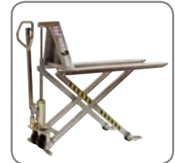
The manual highlifter is also available in an explosion proof version.