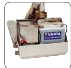
Watertight casing of the lifting motor (TL-E RF-PLUS).