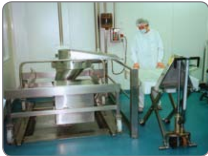
RF-PLUS - for the food industry and the pharmaceutical industry with severe demands for hygiene and cleaning.