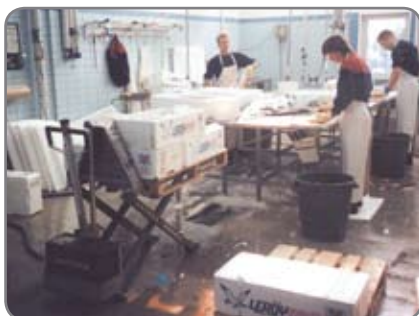
RF-SEMI - for the food industry in areas, where hygiene demands are not so high, but corrosion resistance important.