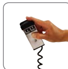
Remote control is available as optional extra (TL-E).