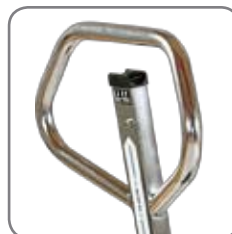
Ergonomic handle ensures the user a relaxed hold.