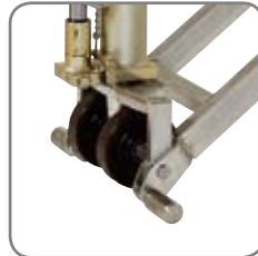
Optimum safety through supporting feet at steering wheel and central location of all control buttons on the handle.