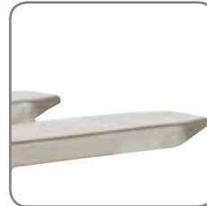
Closed forks mean easy cleaning and few hiding places for bacteria.