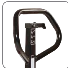
Ergonomic handle ensures the user a relaxed hold.