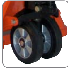
The special rubber wheels are gentle to floor and flagstone layer and do also have eminent anti-static qualities.