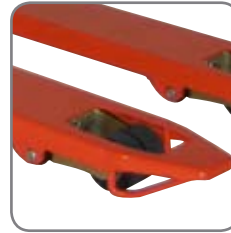
The hoop skates on the forks ensure an easy fork insertion and withdrawal in/out of pallets.