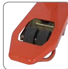
With twin fork wheels it is very easy to change direction.