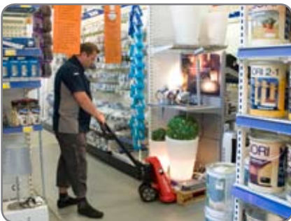
Easy handling of goods is ensured even in very confined spaces.