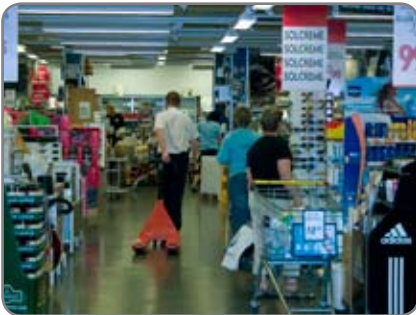
Panther Silent in a supermarket, where comfort and well-being of the customer are vital.