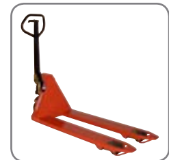
Panther Silent has permanent quick lift.