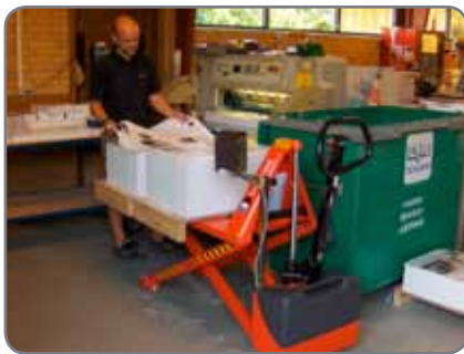
The Thork-Lift is one of the unique ergonomic Interthor products.