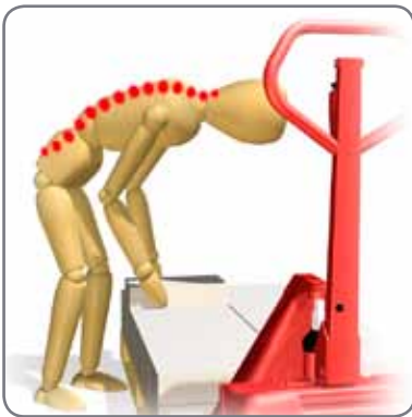
Incorrect working position.

assessment. This will help to identify possible health and safety issues that when addressed will prevent or minimize physical stress at work. The purpose is to create a well-arranged and flexible workplace with a practical organization of the work.