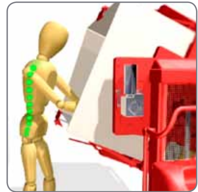
Flexible organization of the work.