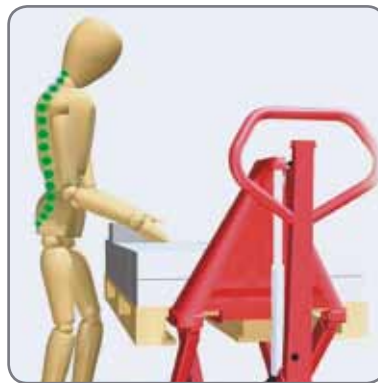
Ideal working position.