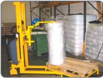
The reel rotator - an ideal alternative when lifting and turning reels.