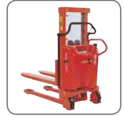
When using a TP or TS without straddle legs, the reel to be handled has to be placed on a pallet.