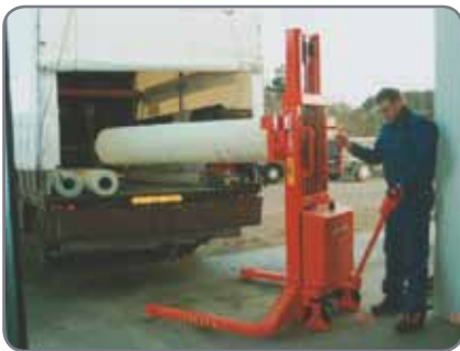
A straddle Trans-Stacker handles reels from a stock to a lorry.