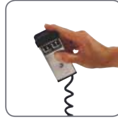
The lifting/lowering function of the electric TP and TS models can be operated by remote control (optional extra).