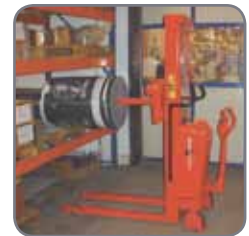
The boom in a stock area.

We also offer tailor-made solutions. Please ask for further information or visit www.interthor.com