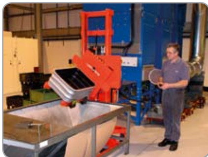
Available with side-tilting forks and/or optional extras, e.g. drum turner, crane arm, spear, remote control, level control.