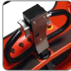
Electronical stepless speed control. Central location of all control buttons.