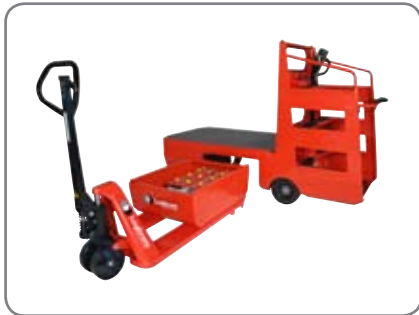
Battery drawer for quick replacement and easy maintenance of the batteries. Perfect for three-shift operation.

Strong construction ensures a long operating life and low maintenance costs.