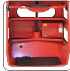
Low entering height for the driver. The pedal acts as a dead man's pedal.