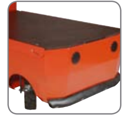
Mechanical parts are enclosed providing protection against external impacts.