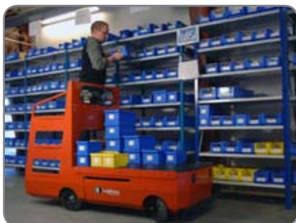
Logirunner being used for order picking. Steps make it easy to reach goods.