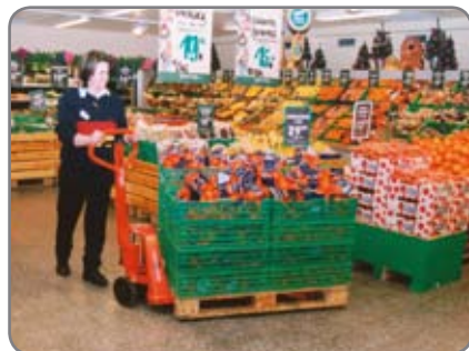
Adjustable fork height - no problems when handling low and worn pallets.