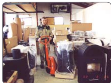
An easy handling of goods is ensured even in very confined spaces.