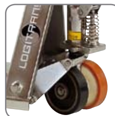
Different wheel types, to suit the needs of the user.