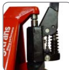
Permanent quick lift.