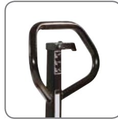
Ergonomic handle ensures the user a relaxed hold. Can be marked with name/department.

Stainless and explosion proof pallet trucks are also available.