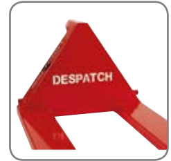
The company name or logo can be cut out in the triangle of the Thork-Truck.