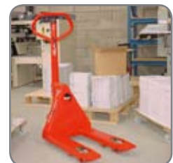
Thork-Truck is available with different fork lengths.