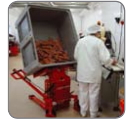
The Ergo-Tilt being used in the food industry.