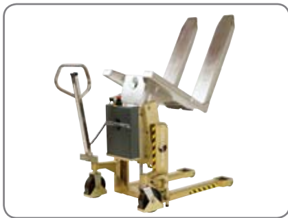
The Ergo-Tilt is also available in stainless steel.