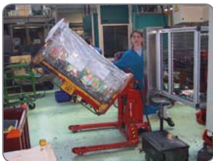
The straddle model makes it possible to handle closed pallets. The Ergo-Tilt being used in the component industry.