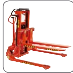
The forks can be fitted on all TP and TS models with and without straddle legs.

Strong construction ensures a long operating life and low maintenance costs.