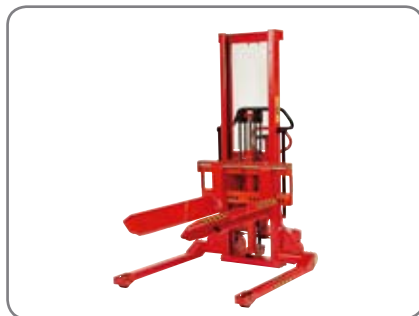
Drum forks - an ideal alternative when lifting and carrying horizontal forks (not quick shift).