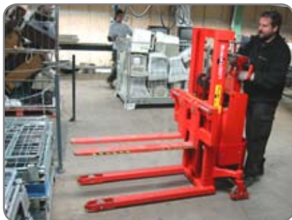
The chisel forks shown being used in a recycling plant of electronic components.