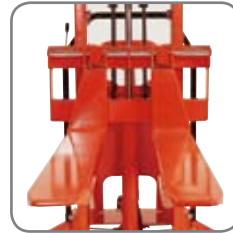
Wrap-over forks: Standard forks for Trans-Positioner and Trans-Stacker.