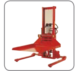
Optional extras: boom, crane arm, platform, reel rotator and drum turner.