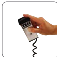
Remote control is available as an optional extra.