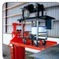
Trans-Stacker with platform lifting trolley from ramp.