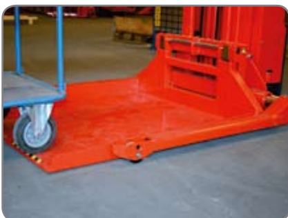
The sloping edge ensures an easy entrance to the platform.