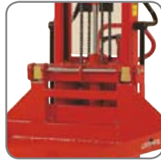
Quick shift system makes it easy to replace the platform with other optional extras or forks.

Strong construction ensures a long operating life and low maintenance costs.