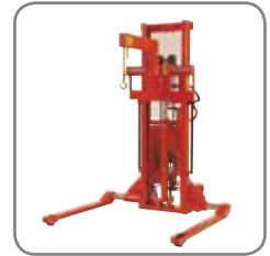
Interthor offers a wide range of optional extras, e.g. crane arm, spear, reel rotator and drum turner.