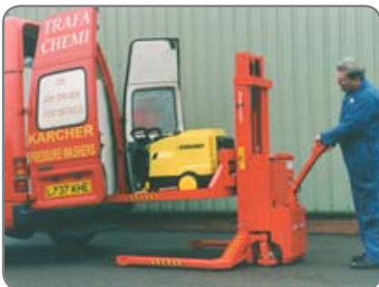
The platform being used carrying a high pressure cleaner.