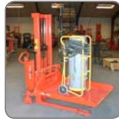
The platform being used carrying a vacuum cleaner.