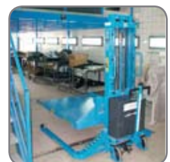
The Interthor product range is available in all RAL-colours.

We also offer tailor-made solutions. Please ask for further information or visit www.interthor.com