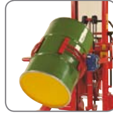
Drum turner - alternative when lifting, carrying and turning vertical or horizontal drums.