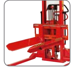
Drum forks - alternative when lifting and carrying horizontal drums.