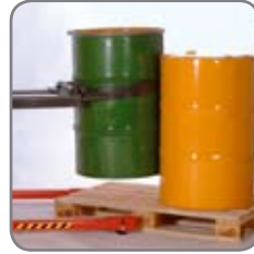
Very flexible handling situation - drums can be gripped from various run-in angles.

Due to stability and safety a counterweight is required in some cases.