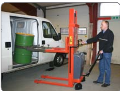
The drum lifter lifts a drum and places it in a lorry.