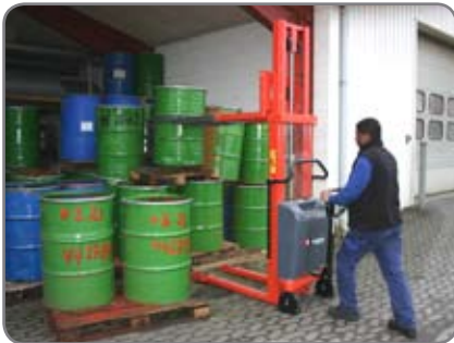
The drum lifter fitted on a Trans-Stacker with fixed forks.

The drum is lifted between or above the legs: A counterweight is not required.