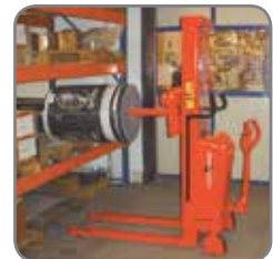
The boom in a stock area.

We also offer tailor-made solutions. Please ask for further information or visit www.interthor.com