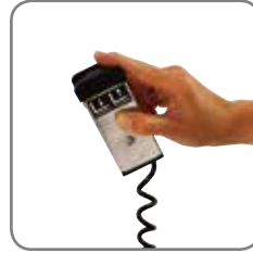
The lifting/lowering function of the electric TP and TS models can be operated by remote control (optional extra).