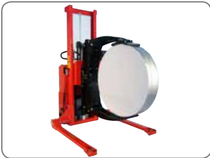
The Reel Rotator - an ideal alternative when lifting and turning reels.