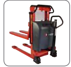
When using a TP or TS without straddle legs, the reel to be handled has to be placed on a pallet.