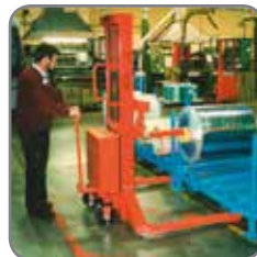
The boom in the packaging industry.