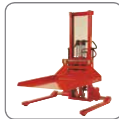
Optional extras, e.g. platform, reel spindle and drum turner.