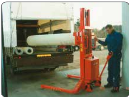
A straddle Trans-Stacker handles reels from a stock to a lorry.